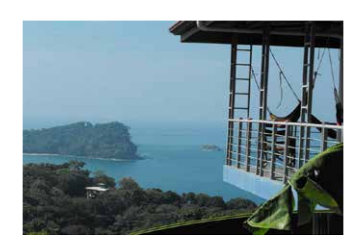
Jan 20 - Feb 2, 2019

Start the New Year with sunshine, combined with painting time, in Manuel Antonio (near the national park) in a 3-story penthouse with a killer view of the pacific ocean!