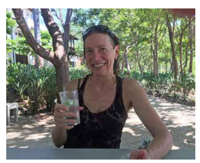
Any level of experience is welcome – beginner through advanced.